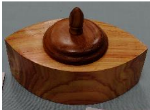
2 David Lock