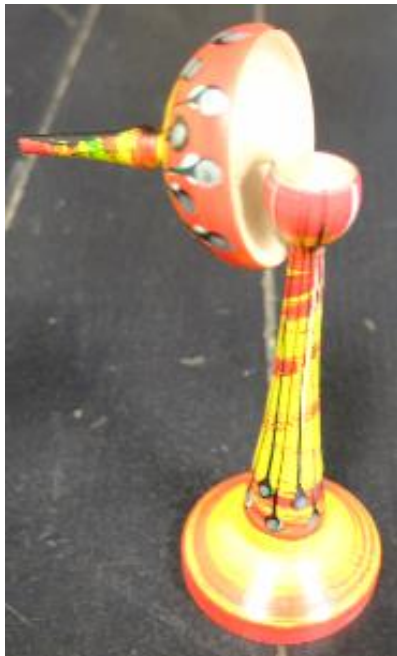
Another colourful example