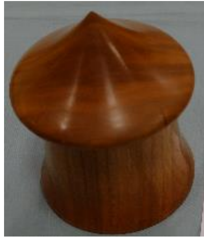
3= Teraina Hird