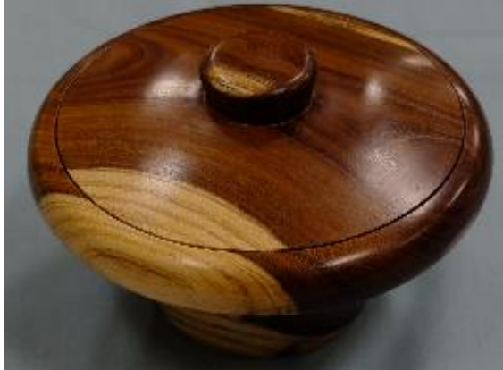
1 st Tim Pettigrew