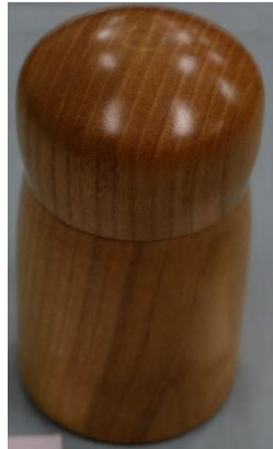
2 nd Jim Burnley