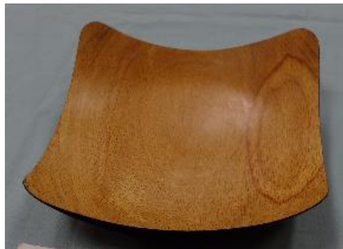
2 Teraina Hird